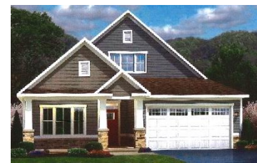
The location of the proposed subdivision, its layout, and sample models